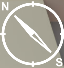
Luton Airport Parkway Station Plan Platform Level