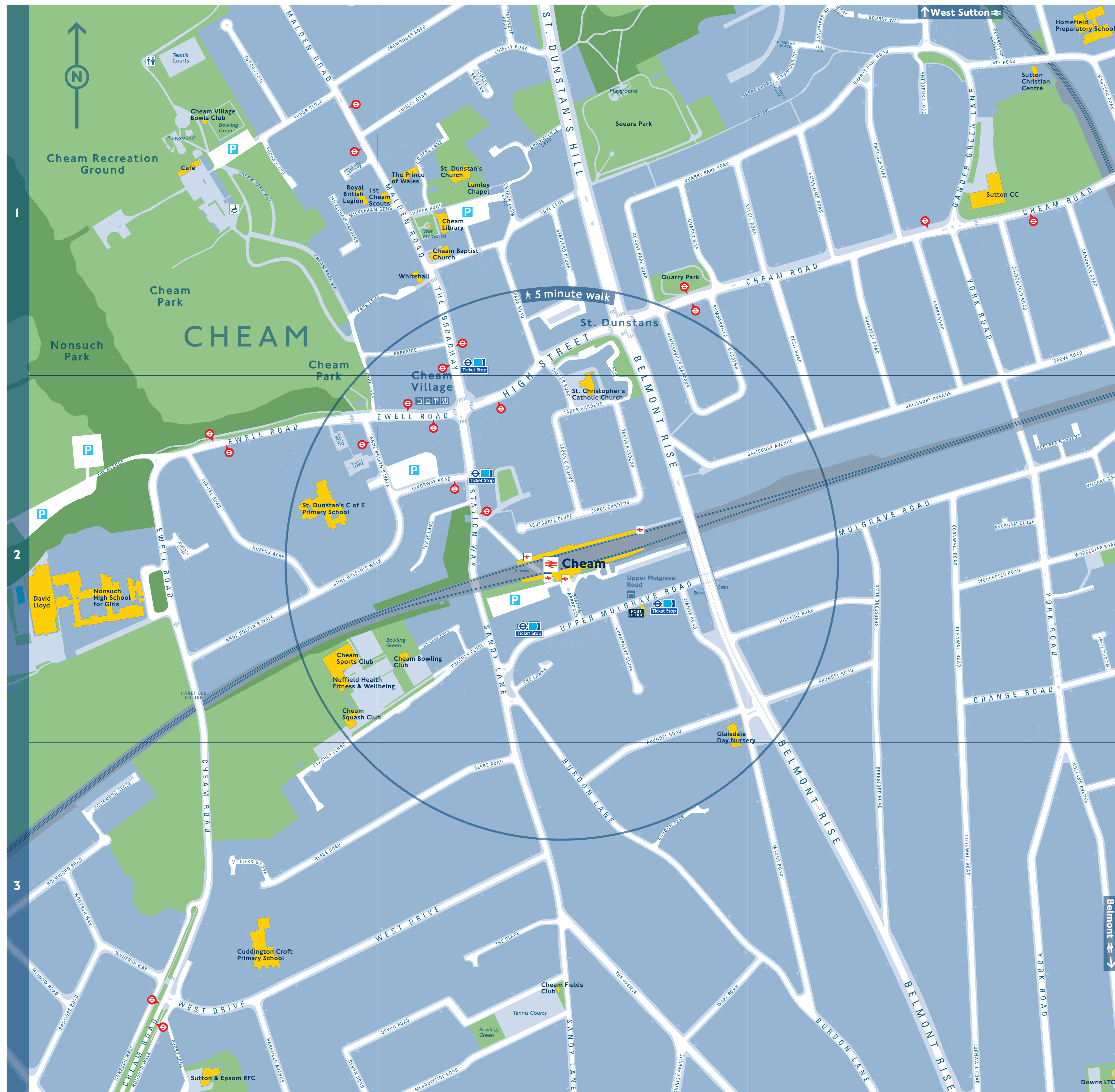
© Crown copyright and database rights 2015 Ordnance Survey 10003971/043